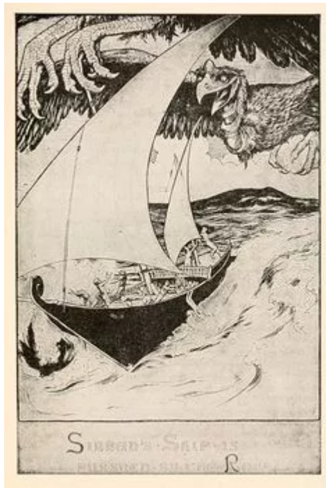
Sinbad the Sailor