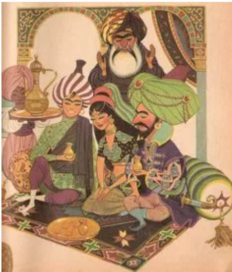
Ali Baba and the 40 Thieves